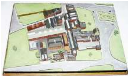
Suttons Seeds model (REDMG:1998.1.82)

This model shows Suttons, The Royal Seed Establishment, as it appeared in the 1930s. Their premises behind the Market Place covered nearly 6 acres and included offices, stores, order rooms and loading floors. From here, seeds were dispatched all round the world.