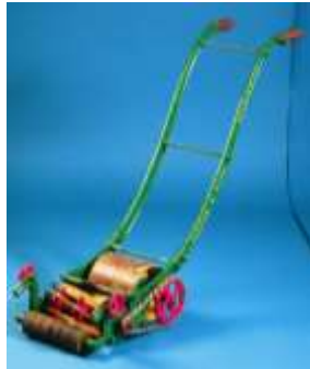
Object Name (museum object number)