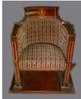
Palace Theatre chair (REDMG:1986.36.1)

This upholstered end-of-row seat with inlaid wood is a demonstration model for the early twentieth century refurbishment of the Palace Theatre in Cheapside, which opened in 1907 for variety performances and closed in 1961.