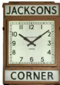
Jackson's clock (REDMG:1996.230.1)